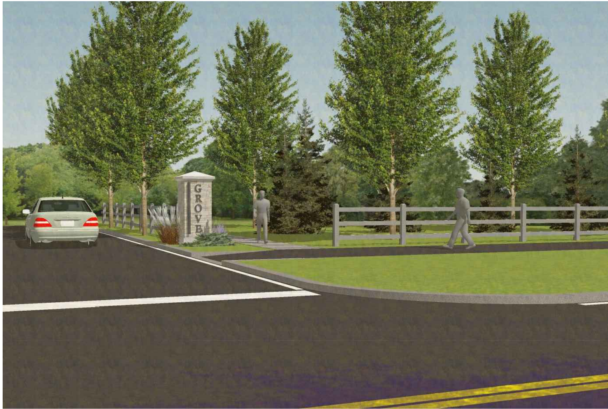
Grove entry looking south

One Column sign shall be located on each side of the entry for a total of 2 signs.