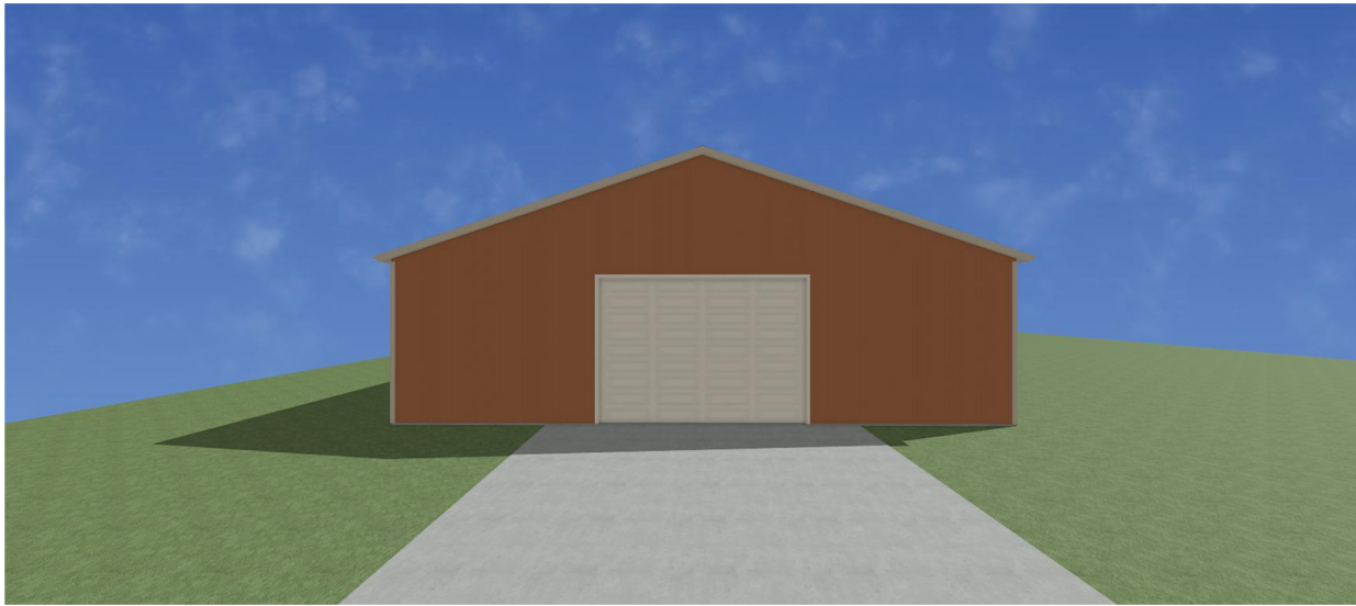
1 NORTH ELEVATION SCALE: NTS