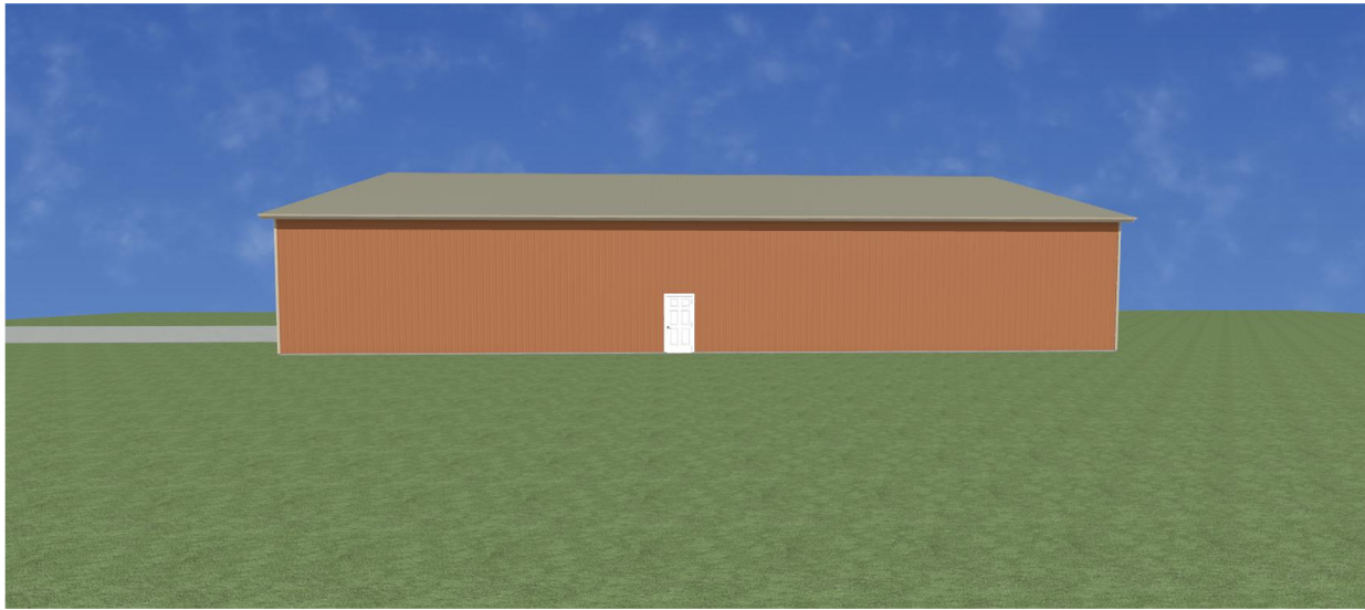
2 WEST ELEVATION SCALE: NTS