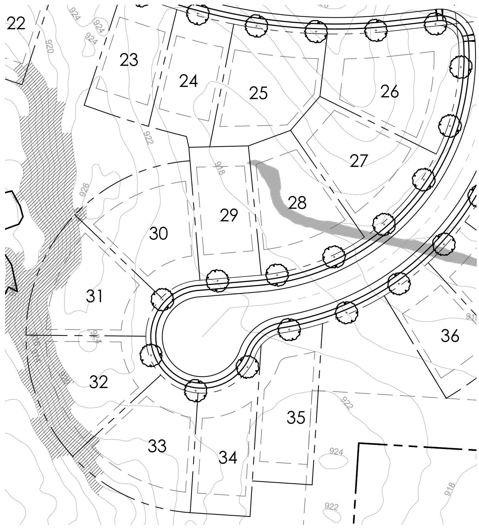
1 PREVIOUS SUBMISSION LOTS SCALE: 1"=60'

*ALL PROPOSED BUILDING PADS MUST BE SETBACK 30' OR GREATER FROM ANY 20% SLOPE