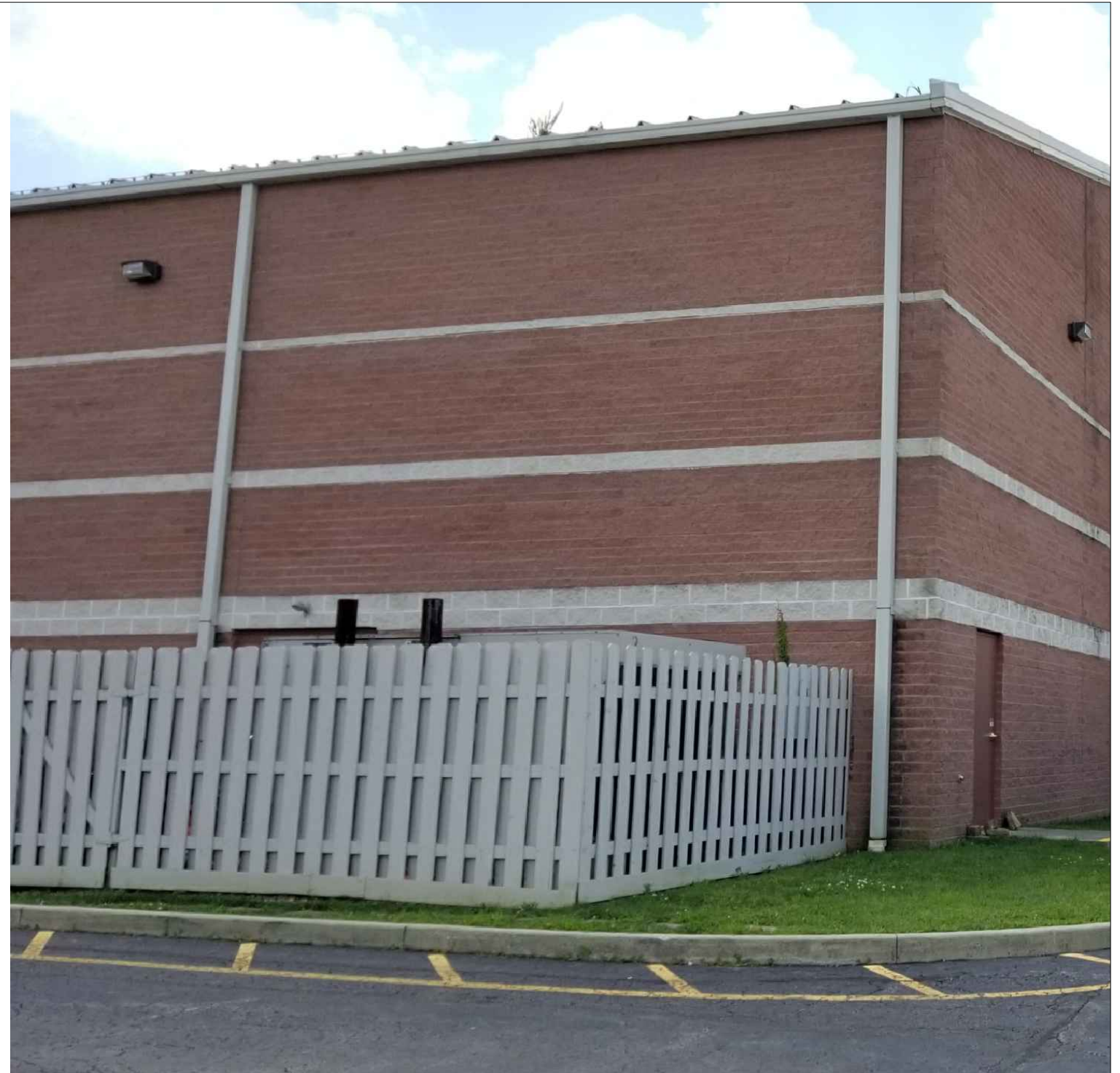
* EXISTING PRIVACY SCREEN SCALE: NOT TO SCALE